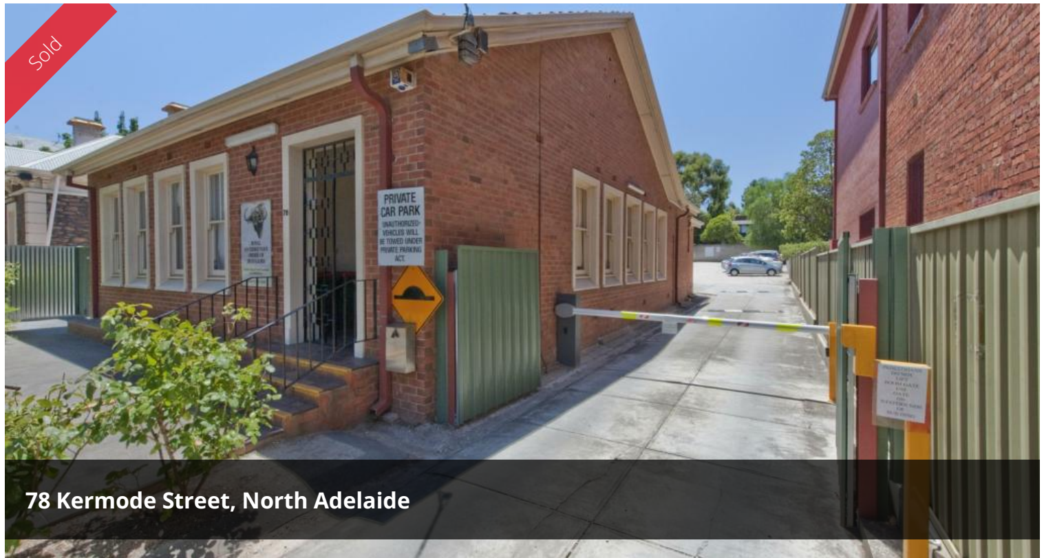
78 Kermod Street, North Adelaide