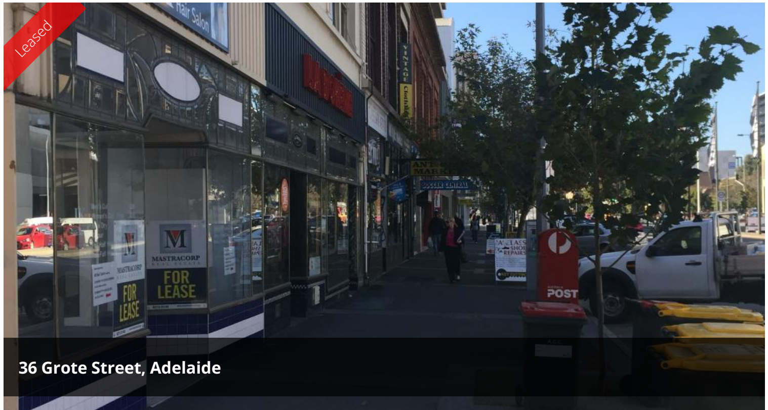
36 Grote Street, Adelaide