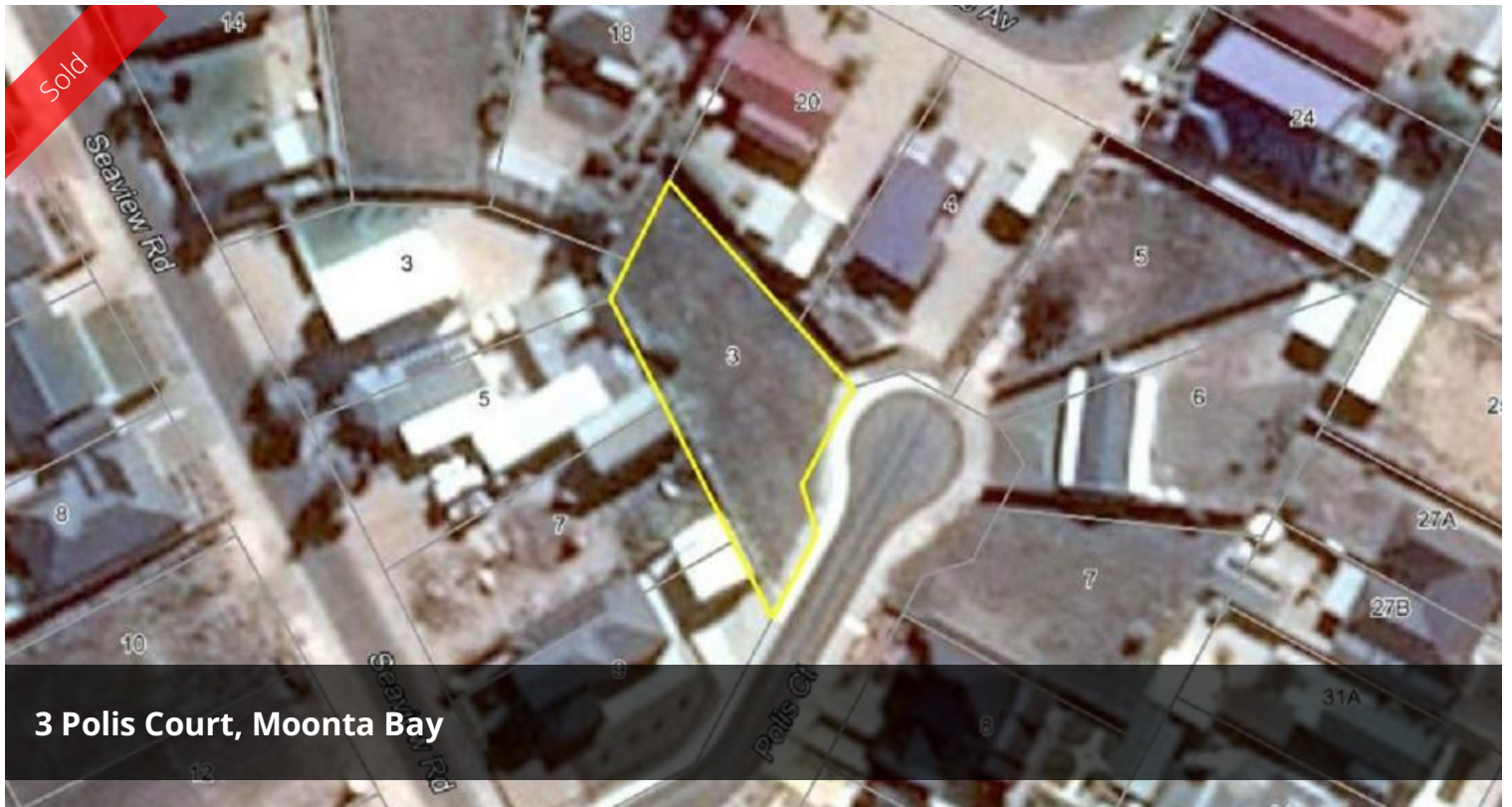
3 Polis Court, Moonta Bay