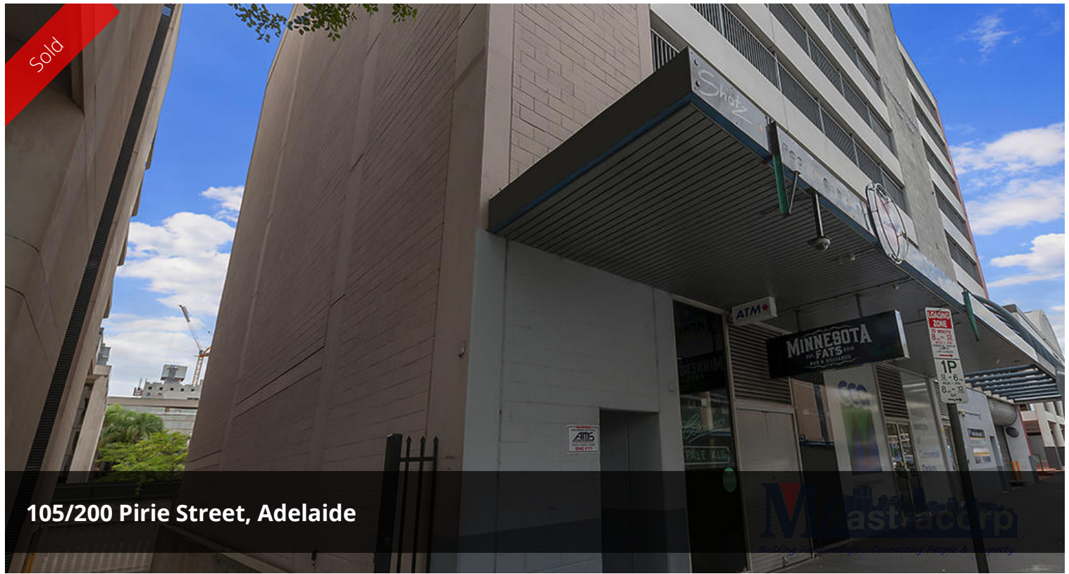
105/200 Pirie Street, Adelaide