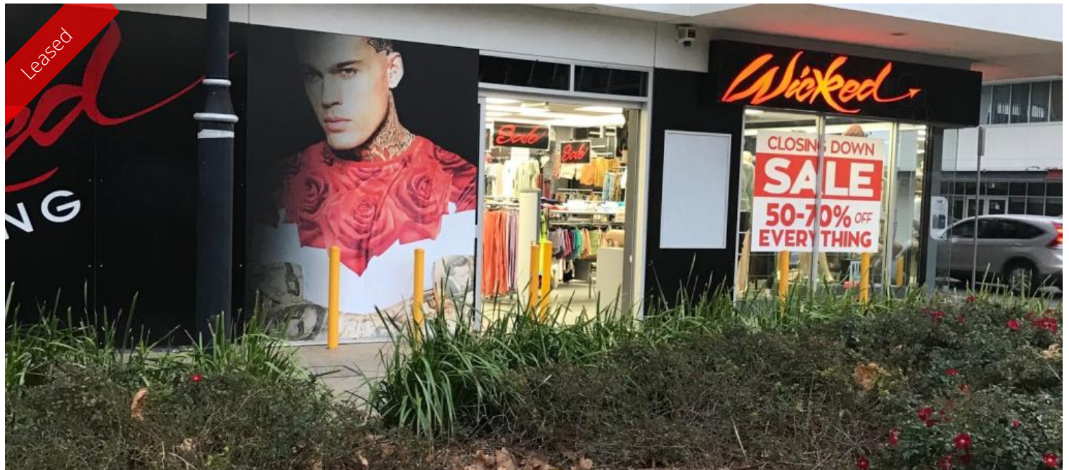
SHOP 3, 18-22 Hurtle Pde, Mawson Lakes