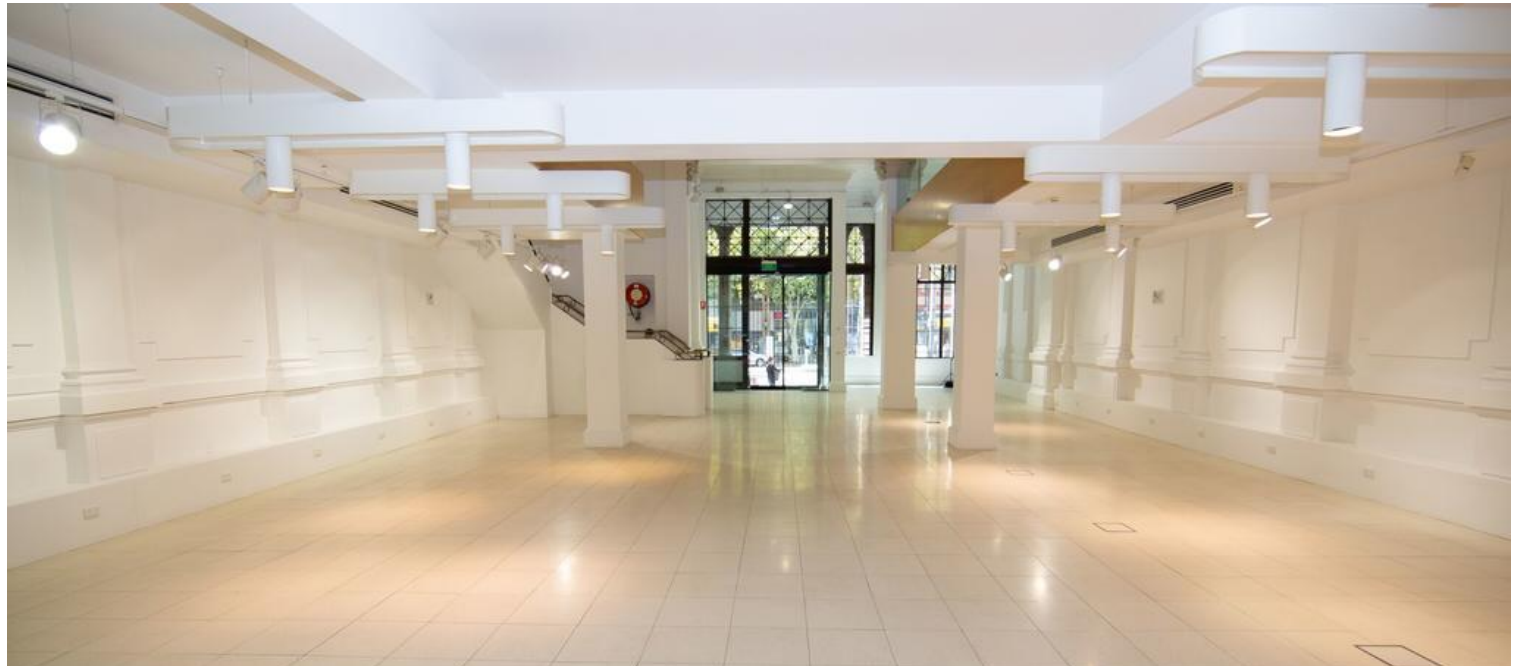
Ground Floor, 25 King William St, Adelaide