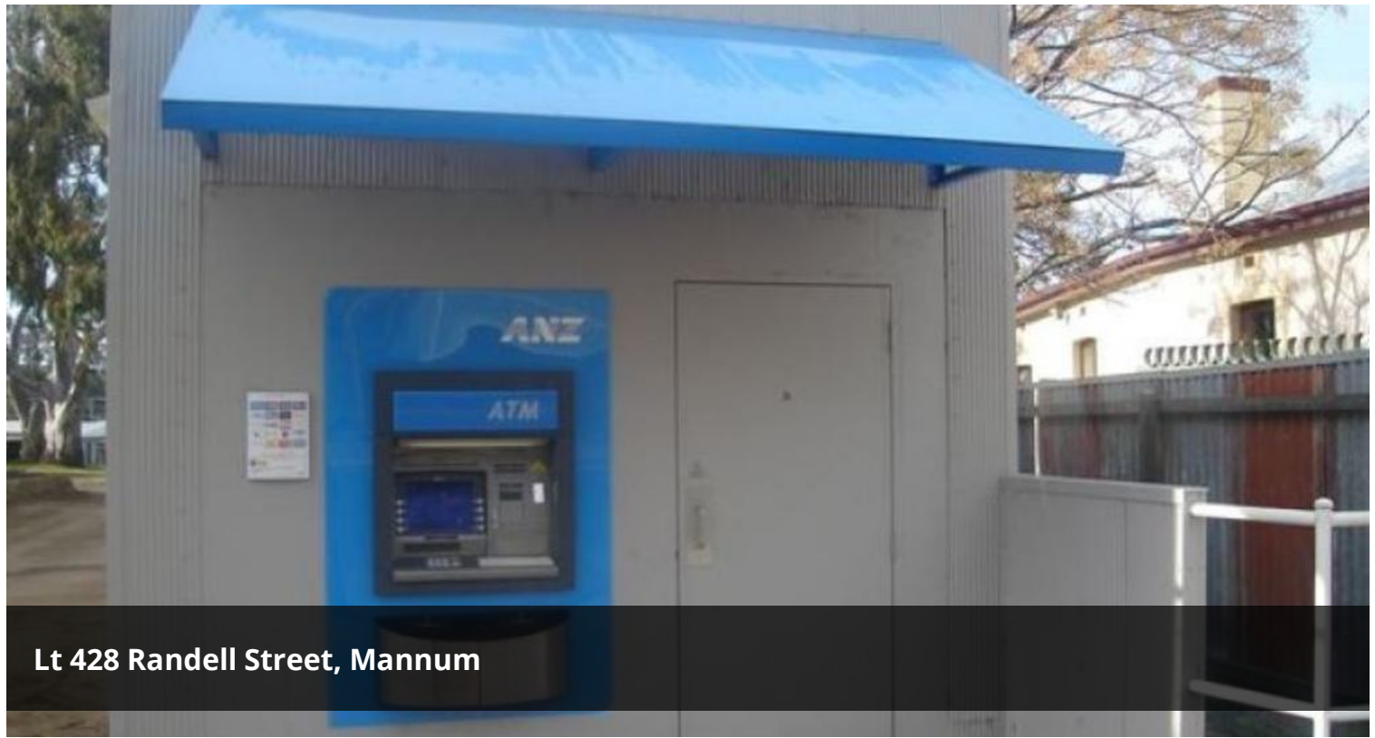
Lt 428 Randell Street, Mannum