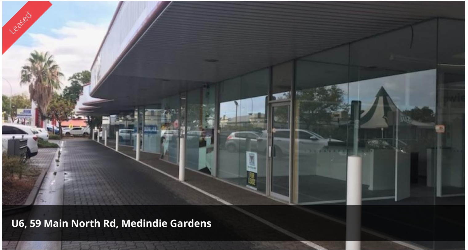
U6, 59 Main North Rd, Medindie Gardens