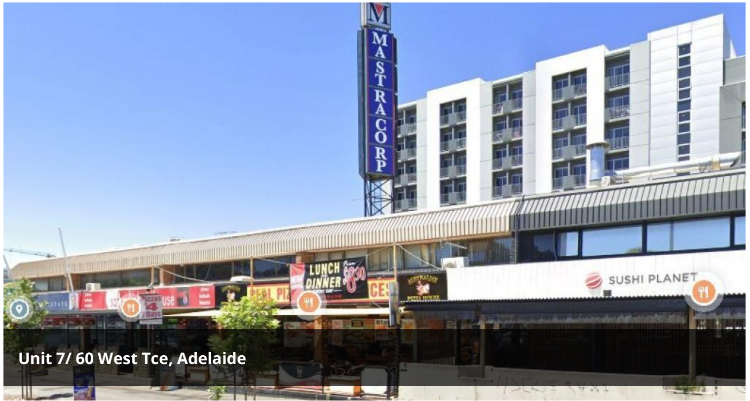
Unit 7/ 60 West Tce, Adelaide