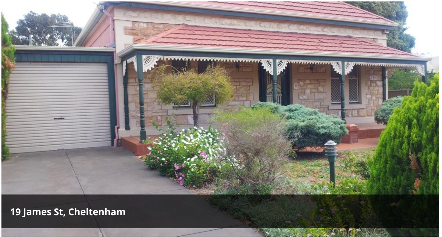
19 James St, Cheltenham