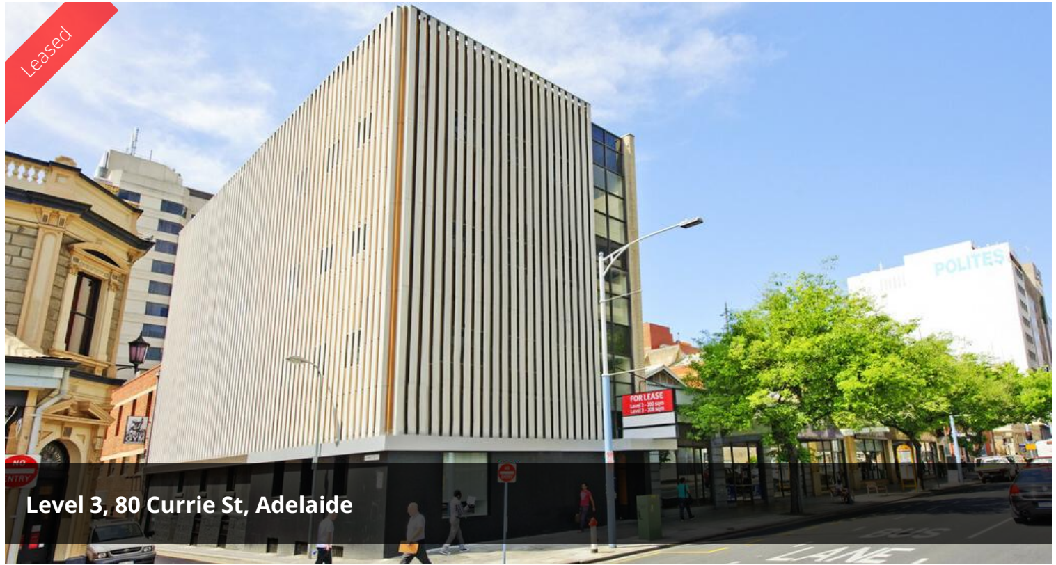
Level 3, 80 Currie St, Adelaide