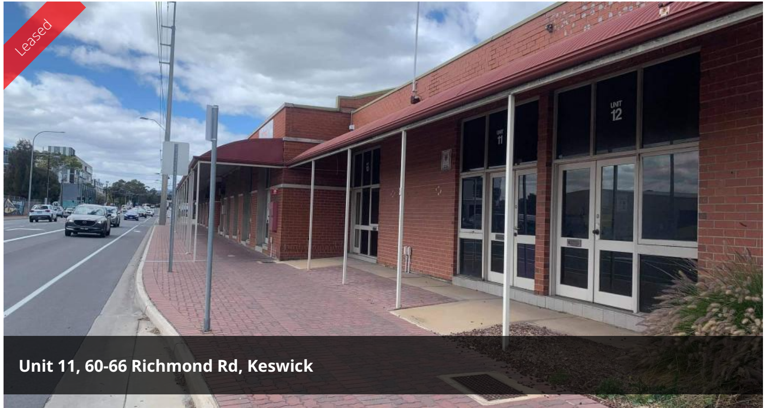
Unit 11, 60-66 Richmond Rd, Keswick