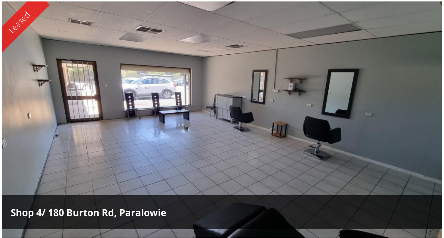
Shop 4/ 180 Burton Rd, Paralowie