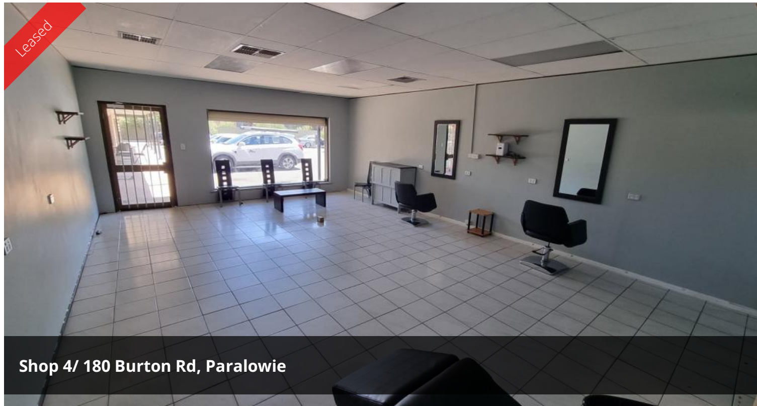
Shop 4/ 180 Burton Rd, Paralowie