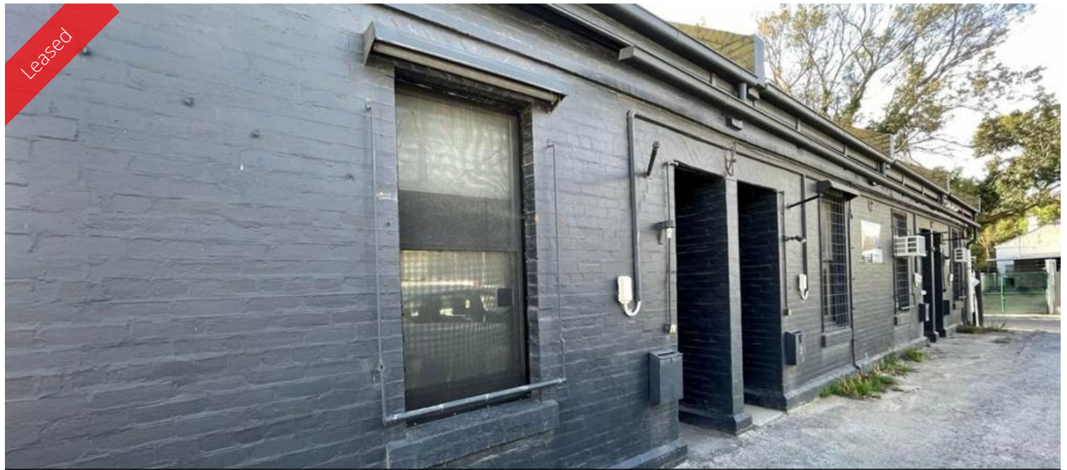
Unit 1, 1-3 Irwin Lane, Unley