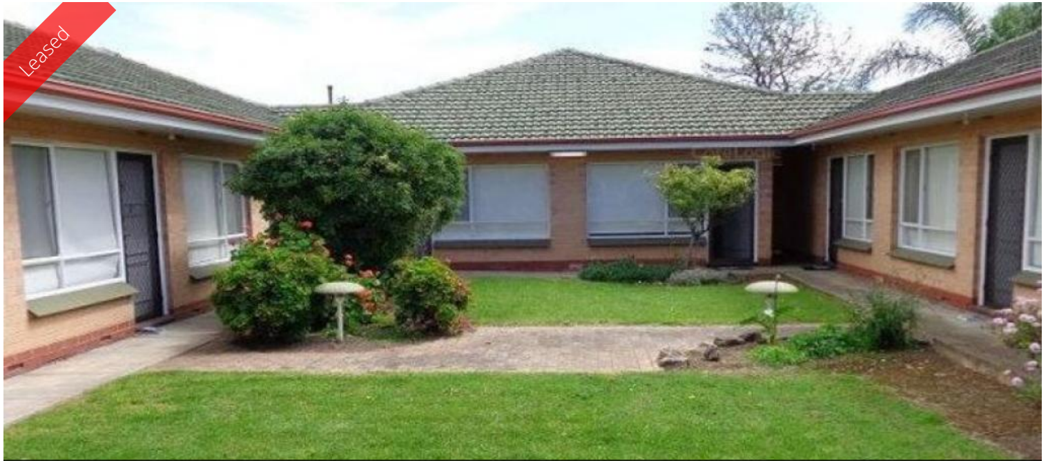
Unit 7, 362 Hampstead Rd, Clearview