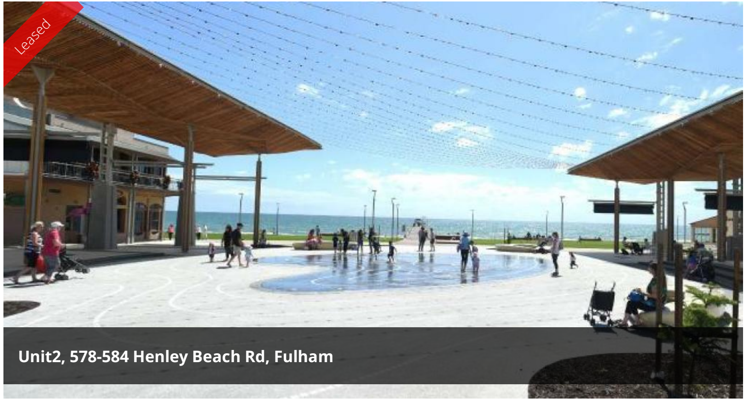
Unit2, 578-584 Henley Beach Rd, Fulham