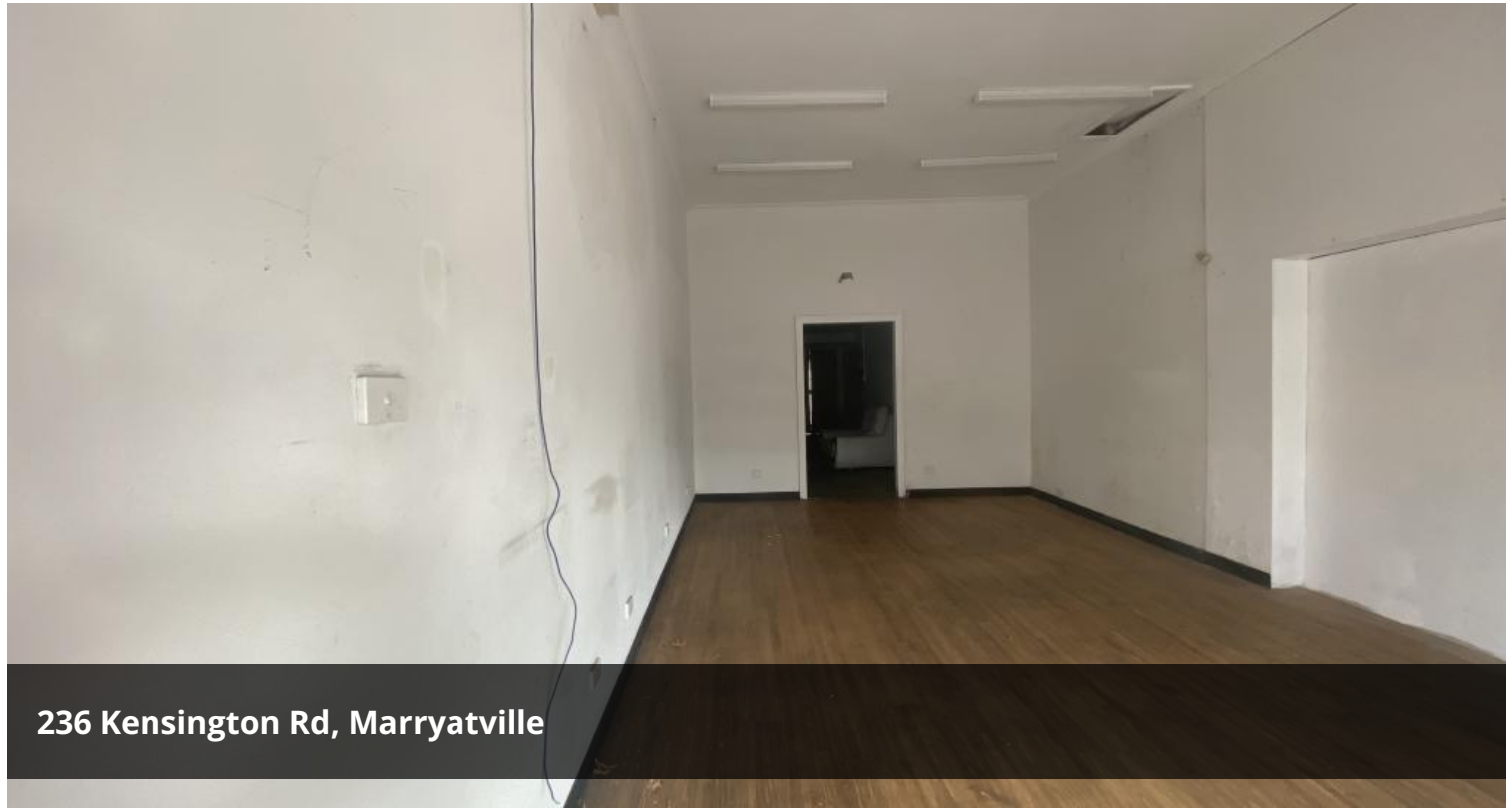
236 Kensington Rd, Marryatville