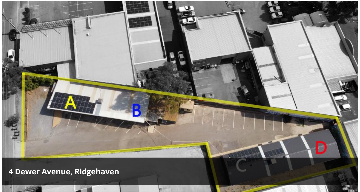
4 Dewar Avenue, Ridgehaven