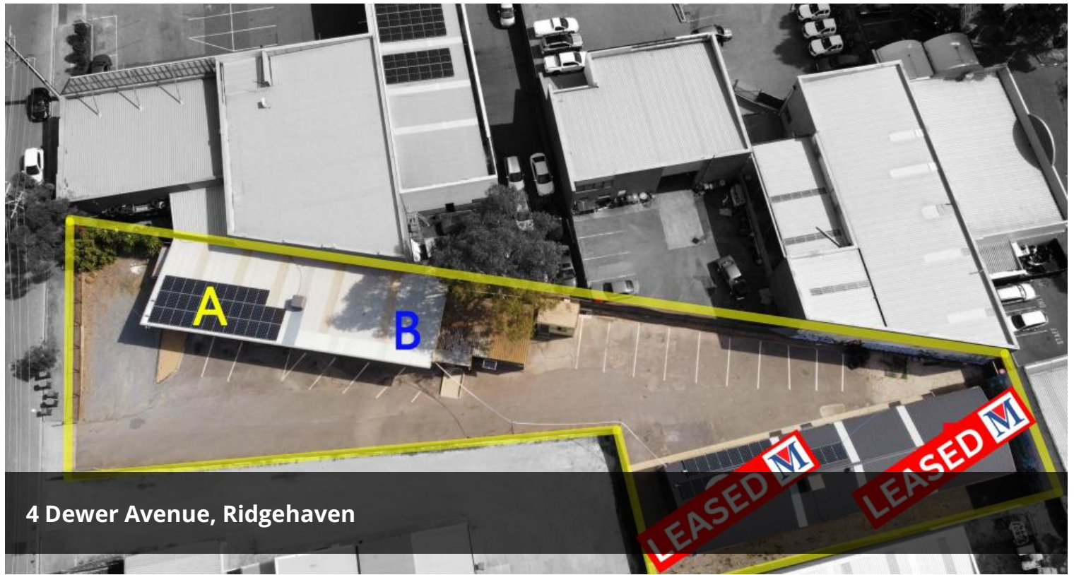
4 Dewar Avenue, Ridgehaven