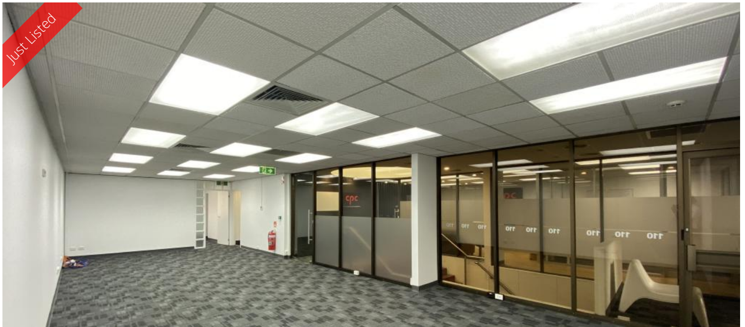
Suite 3, 110 Hutt St, Adelaide