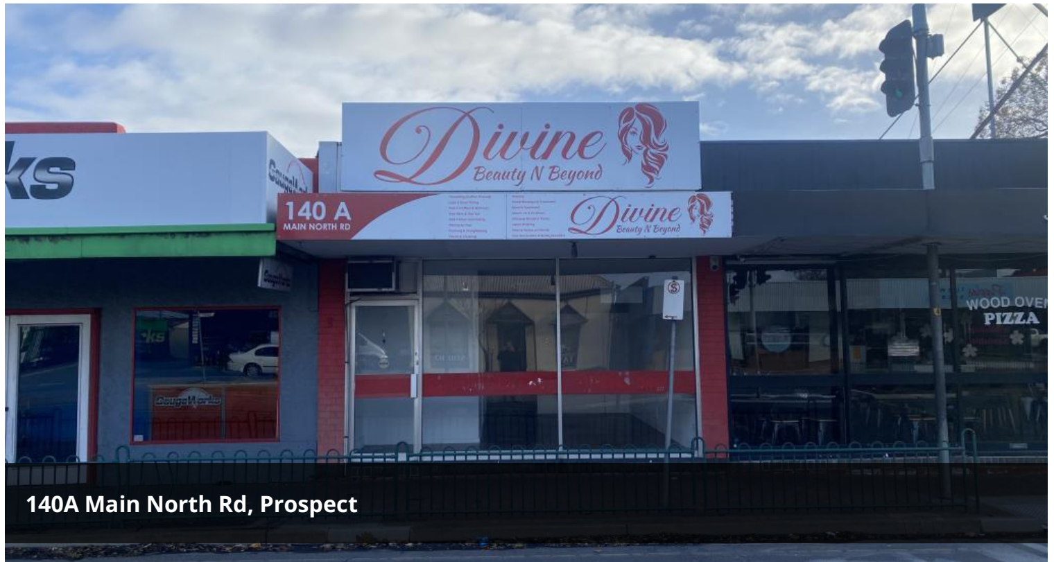
140A Main North Rd, Prospect