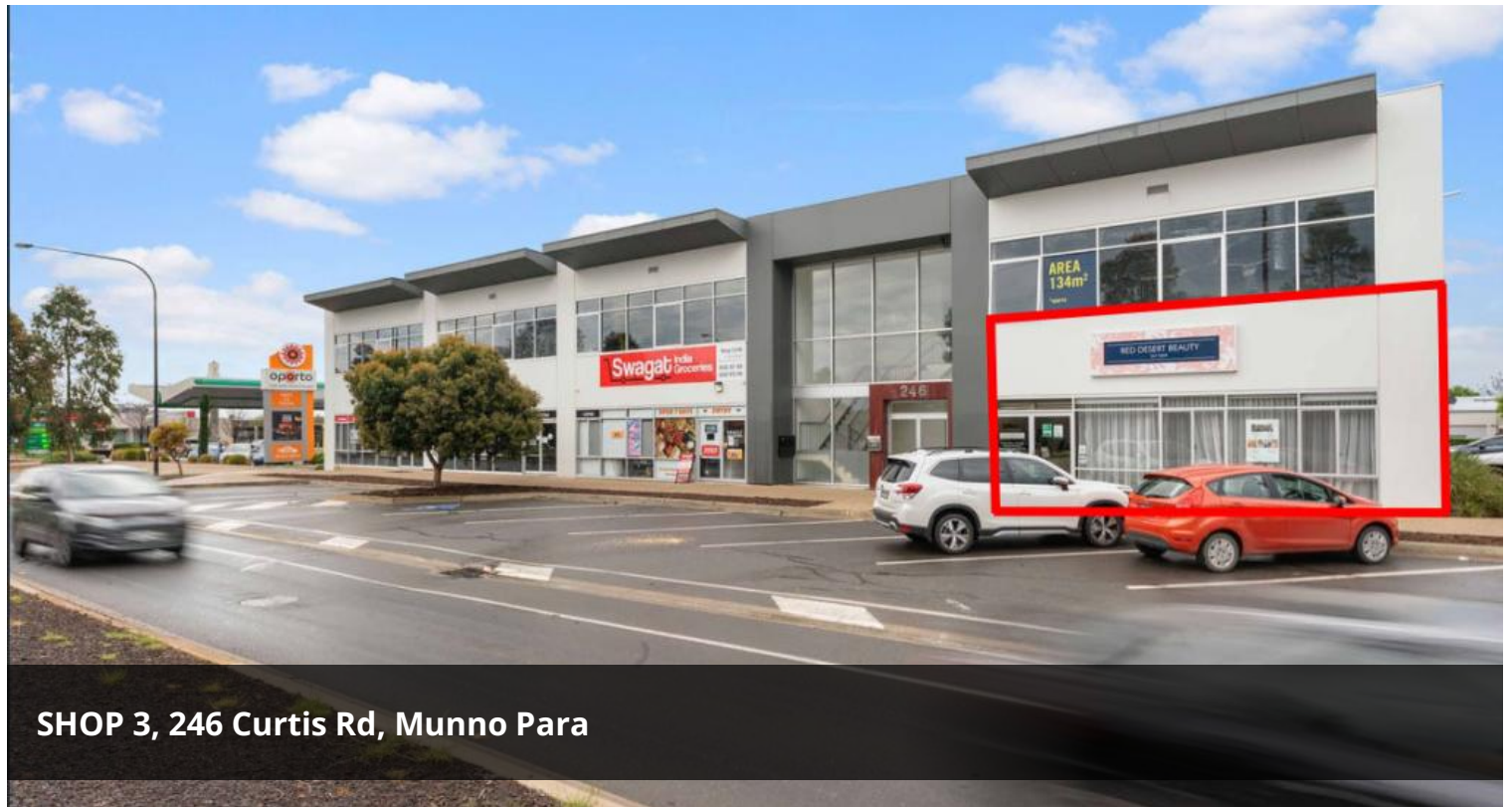
SHOP 3, 246 Curtis Rd, Munno Para