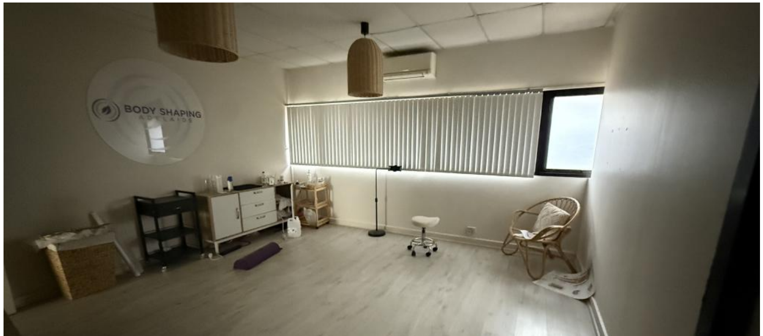
Unit 3A, 60 West Tce, Adelaide