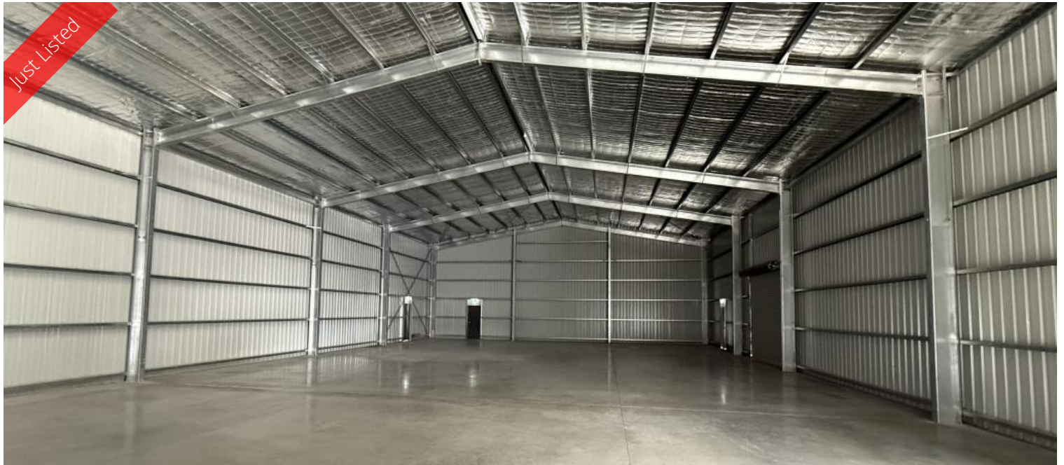
Warehouse 4, 132 Tolley Rd, St Agnes