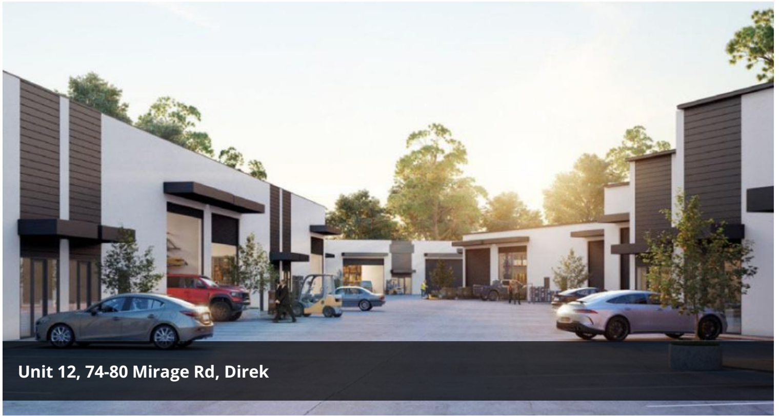
Unit 12, 74-80 Mirage Rd, Direk