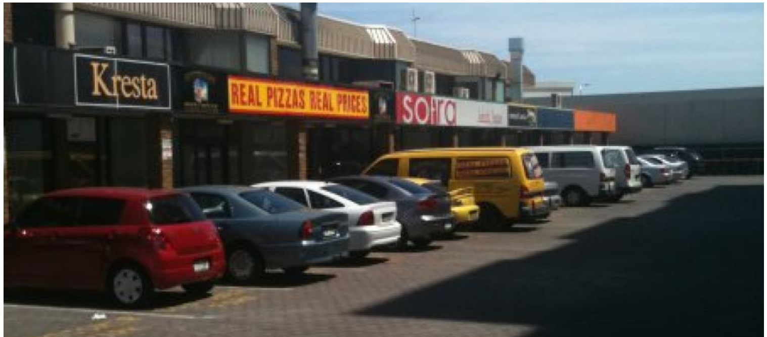
7, 60 West Terrace, Adelaide